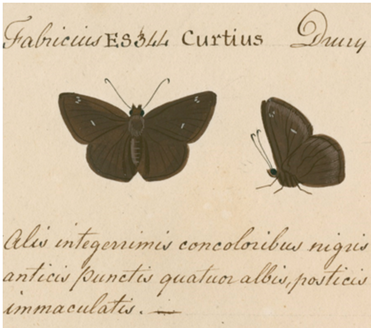
FIGURE 1. Illustration of [ Hesperia ] curtius in the unpublished Jones' Icones 1785–1787? (volume V). The translation of the notation is: wings entirely and uniformly black, the anterior ones with four white spots, the posterior ones immaculate.